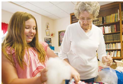
Frontier Health Adventure Program's ropes challenge course on Greenwood Drive.

While Monday's service blitz at Girls Inc signaled the mobilization of the volunteers at nonprofit agencies around the Tri-Cities, the work actually began several weeks ago with projects including a pre-season clean-up day held in advance of the summer opening of the